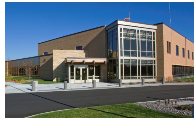
Monticello, Minnesota On-Campus Ambulatory Care Facility & Cancer Center Developed 2007 60,000 Square Feet