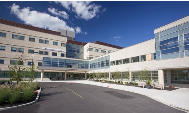
Voorhees Township, New Jersey On-Campus Ambulatory Care Center & Medical Office Building Developed 2012 300,000 Square Feet