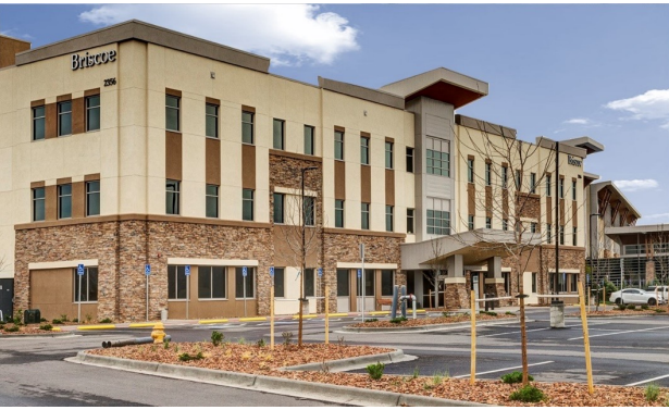
Castle Rock, Colorado On-Campus Medical Office Building II Developed 2016 60,000 Square Feet