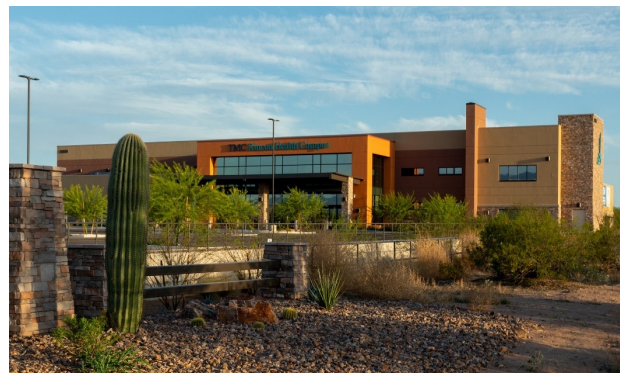
Tucson, Arizona Medical Office Building Acquisition and Redevelopment 2020 40,500 Square Feet