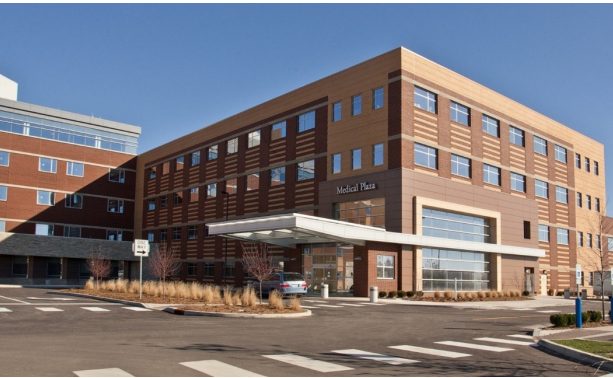
Mt. Vernon, Illinois On-Campus Medical Office Building & Outpatient Specialty Center Developed 2013 141,000 Square Feet