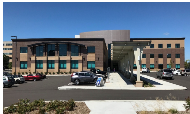
Edina, Minnesota Free Standing Orthopedic Specialty Center Developed 2018 68,000 Square Feet + Parking Structure