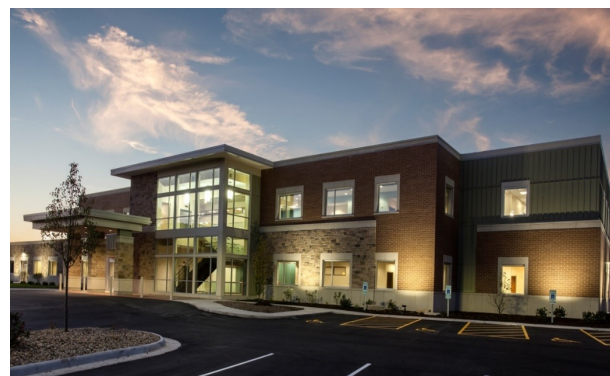
Moline, Illinois Off-Campus Ambulatory Care Center / First Phase of Wellness Medical Campus Developed 2013 50,000 Square Feet