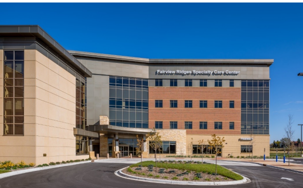
Burnsville, Minnesota On-Campus Specialty Care Center & Ambulatory Surgery Center Developed 2014 133,000 Square Feet