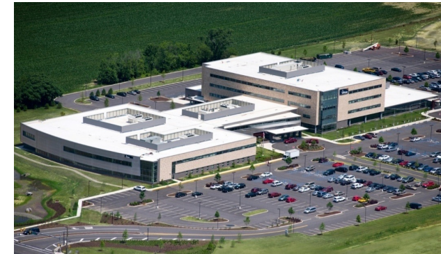
Washington Township, New Jersey Free Standing Health & Wellness Center Developed 2009 250,000 Square Feet