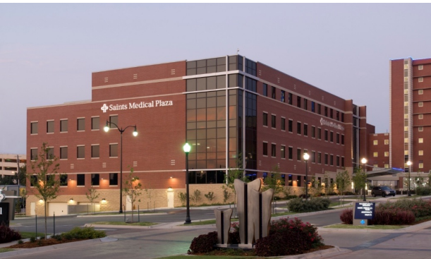
Oklahoma City, Oklahoma On-Campus Medical Office Building Developed 2007 80,000 Square Feet