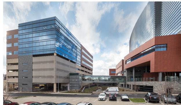
Stamford, Connecticut On-Campus Integrated Care Building with 388 Parking Space Structure Developed 2016 97,250 Square Feet