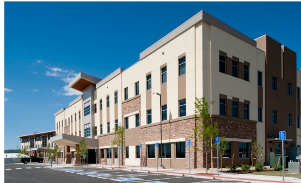
Castle Rock, Colorado On-Campus Medical Office Building I Developed 2013 60,000 Square Feet