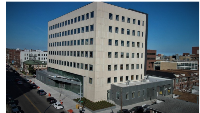
Brooklyn, New York On-Campus Medical Office Building with below-grade parking for 263 vehicles Developed 2021 145,000 Square Feet