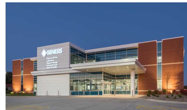
Davenport, Iowa Free Standing Medical Office Building Developed 2018 40,000 Square Feet