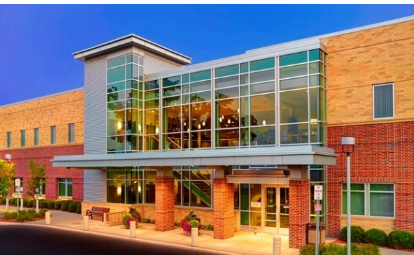
Chanhassen, Minnesota Free Standing Multi-Specialty Clinic Developed 2005 50,000 Square Feet