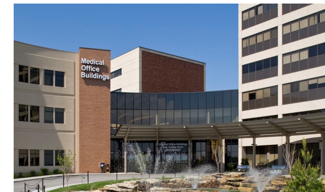
St. Louis, Missouri On-Campus Medical Office Building Developed 2006 80,000 Square Feet