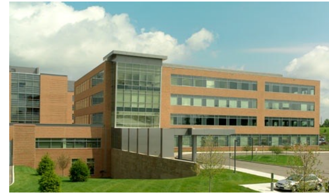
Fenton, Missouri On-Campus Ambulatory Care Center & Medical Office Building Developed 2009 106,704 Square Feet