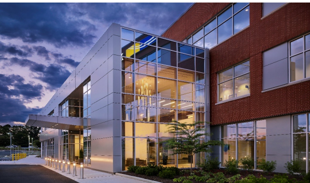
Bel Air, Maryland Free Standing Ambulatory Care Center Developed 2016 107,000 Square Feet