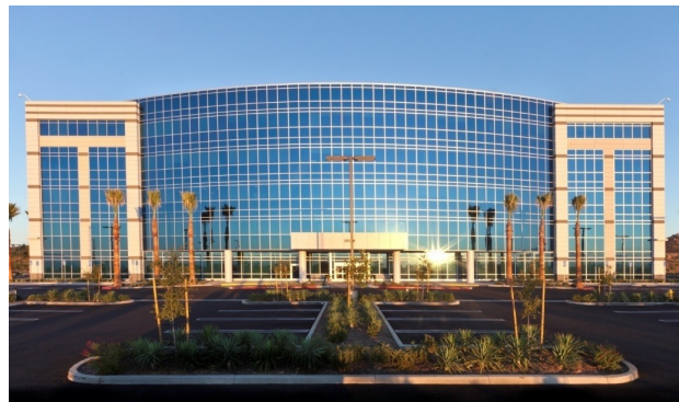
Murrieta, California On-Campus Ambulatory Center & Medical Office Building Developed 2011 160,000 Square Feet