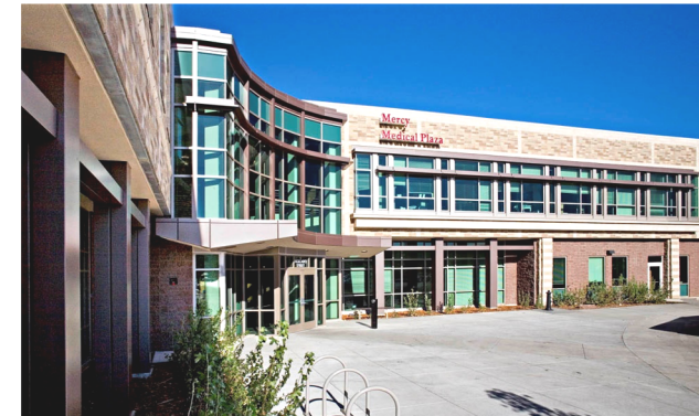
Durango, Colorado On-Campus Medical Office Building Developed 2006 160,000 Square Feet