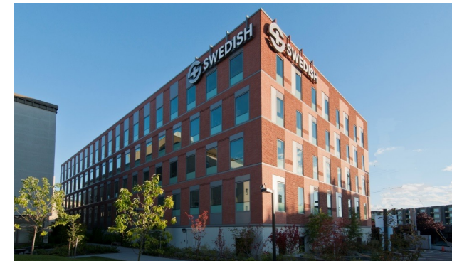
Seattle, Washington On-Campus Medical Office Building Developed 2012 80,000 Square Feet