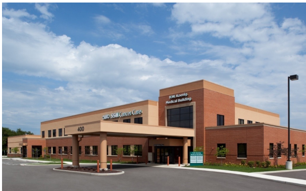
Lake St. Louis, Missouri On-Campus Ambulatory Care Facility & Cancer Center Developed 2008 50,000 Square Feet