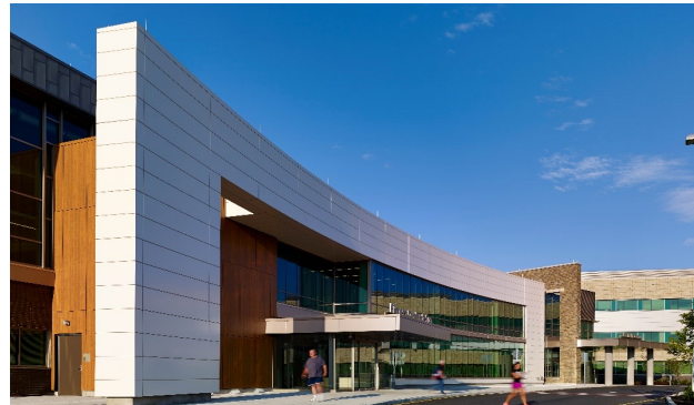
Moorestown, New Jersey Free Standing Health & Wellness Center Developed 2012 203,000 Square Feet