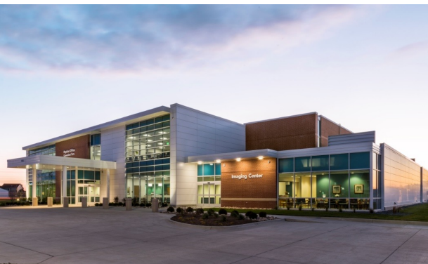
Bettendorf, Iowa Free Standing Ambulatory Care Center Developed 2014 40,000 Square Feet