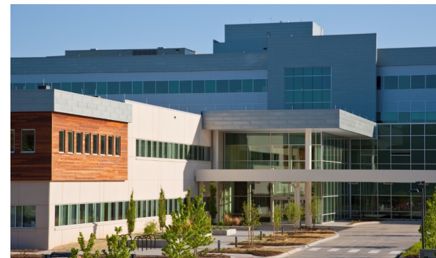
Bellevue, Nebraska New Greenfield Hospital & Medical Office Building Developed 2010 320,000 Square Feet