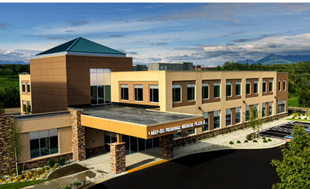
Palmer, Alaska On-Campus Medical Office Building II Developed 2018 40,000 Square Feet