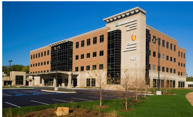
St. Paul, Minnesota Free Standing Sponsored Specialty Clinic Developed 2007 250,000 Square Feet