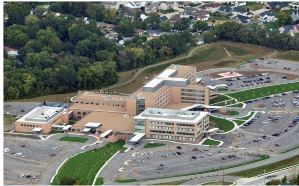
Fenton, Missouri On-Campus Ambulatory Surgery Center & Neuro Surgical Institute Developed 2009 40,705 Square Feet