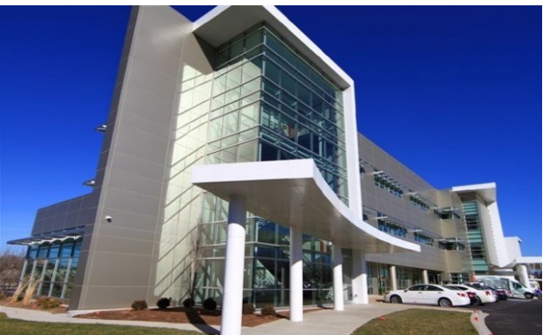
Bridgeton, Missouri On-Campus Rehabilitation Hospital Developed 2011 66,914 Square Feet