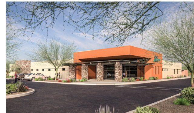
Tucson, Arizona Ambulatory Surgery Center Acquisition Development 2021 17,000 Square Feet